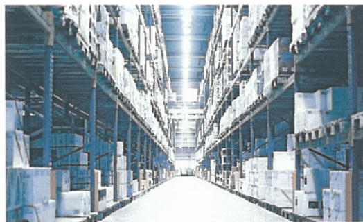
Intelligent logistics concept ensures fast availability of parts

MAHLE Industriefiltration has been producing high-quality industrial filters for fluid technology, dust filtration, and process technology for many years. As an innovative, reliable development partner and supplier for the leading manufacturers of hydraulic systems and equipment all over the world, MAHLE Industriefiltration is your expert systems partner in all areas of pressure fluids filtration.